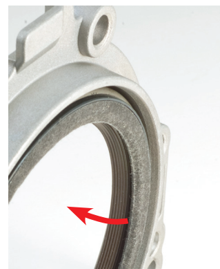
Figure 2 Sealing lip faces the engine interior