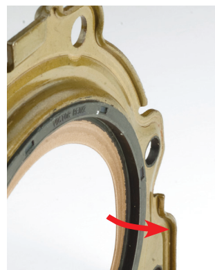
Figure 1 Sealing lip faces the transmission

With kind regards Your VICTOR REINZ Service Team